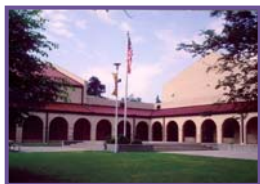
Franciscan Center Theater

Lights, Camera, Action ~ The Stage Is Yours! Like no other state pageant you have seen! Be part of a full theater production! Lourdes College Campus Picturesque Northwest Ohio City of Sylvania.