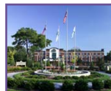
Wingate Inn & Suites

Lights, Camera, Action ~ The Stage Is Yours! Like no other state pageant you have seen! Be part of a full theater production! Lourdes College Campus Picturesque Northwest Ohio City of Sylvania.